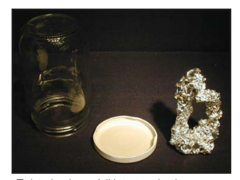
Twist aluminum foil into terrain shape, making sure it will fit back inside the jar when finished.