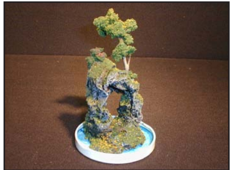
Spray with Project Glue and sprinkle Turf colors. Make Trees with sticks and Bushes or Foliage Fiber. Glue trees and Bushes in place. Sprinkle Yellow Flowers and Spray with Project Glue to seal. Glue scene to inside of jar lid, replace jar and display.